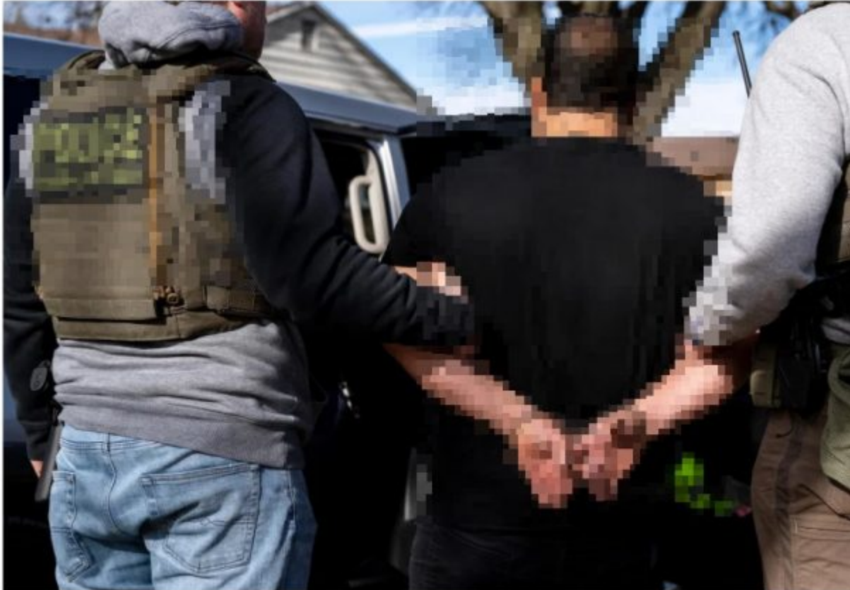
US Immigration and Customs Enforcement agents detain a suspect during a multi-agency targeted enforcement operation in Lyons, Illinois, on January 26.

https://edition.cnn.com/2025/04/25/politics/doge-building-master-database-immigration/index.html